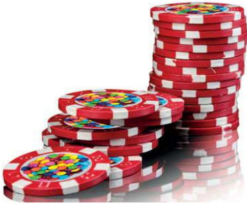
Small object printing

Detach the module to keep it out of your way while performing rigid jobs or just leave it docked, whichever is more convenient for you. The roll-to-roll system fits in perfectly with the moving gantry and allows minimal waste production while printing on flexible media.