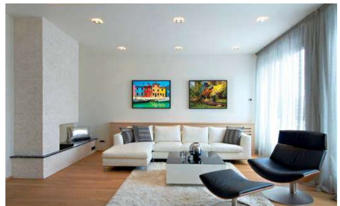
In-house decoration - dibond