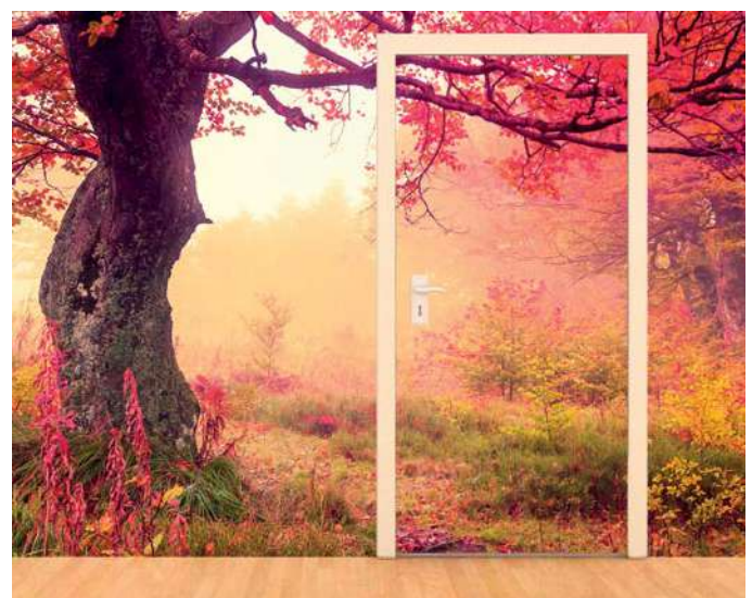
In-house decoration - paper and wood