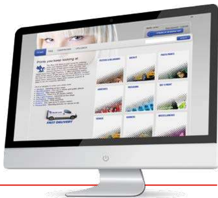
StoreFront web-to-print software