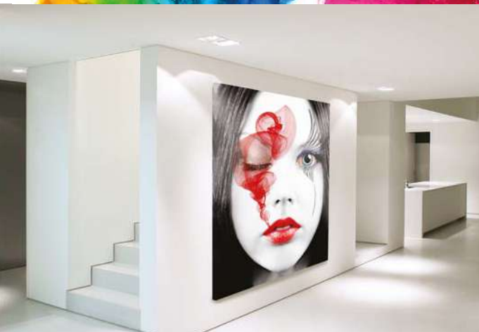
In-house decoration – dibond