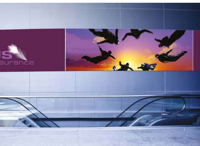
In-store communication – forex

StoreFront, a comprehensive web-to-print service, is designed to handle incoming orders from the internet. Automated payment processing and error-free print preparation ensure new jobs are ready for printing in no time and with a minimum of operator intervention.