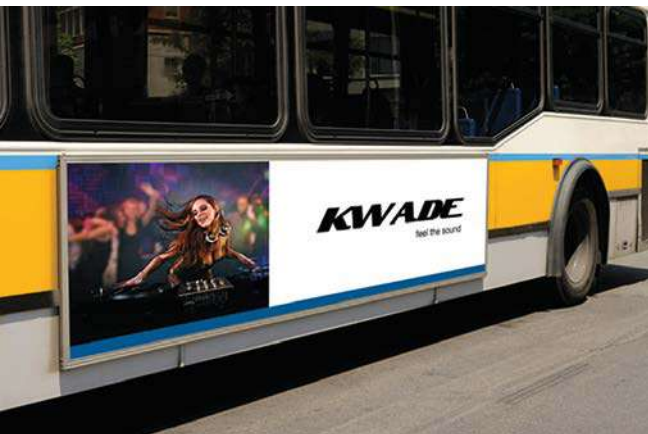
Outdoor communication – vinyl