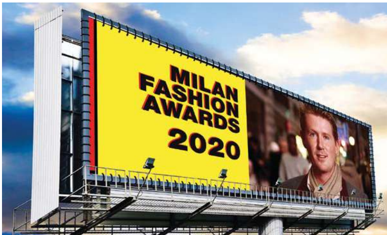
Outdoor communication – vinyl