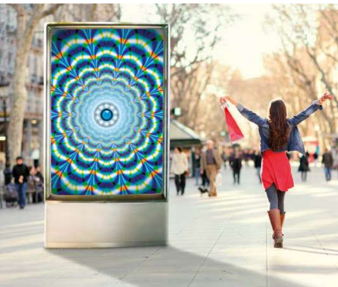
Outstanding print quality on backlit applications

Your day-to-day roll-to-roll sign & display jobs? Hand them over to your very solid Anapurna RTR3200i LED. This dedicated roll-to-roll UV LED-curable printer, which comes in a six color version and a four color plus white version, handles a broad scope of flexible media for indoor and outdoor applications.