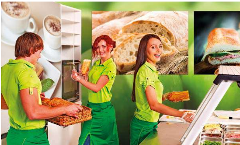
In-store communication – Dibond