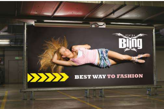
Outdoor communication – vinyl

StoreFront, a comprehensive web-to-print service, is designed to handle incoming orders from the internet. Automated payment processing and error-free print preparation ensure new jobs are ready for printing in no time and with a minimum of operator intervention.