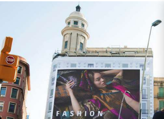
Outdoor communication – vinyl