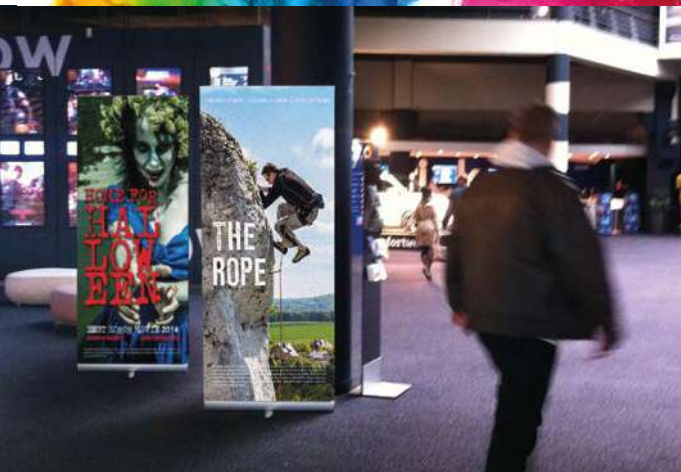
Outdoor communication – vinyl