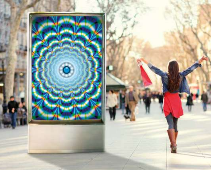
Outstanding print quality on backlit applications