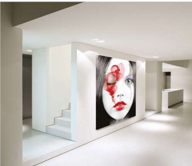
In-house communication – dibond