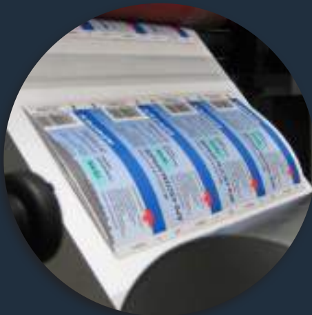
330mm web width with a 430mm option available.