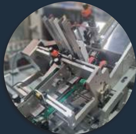
Utilising our internally developed booklet folding mechanism.