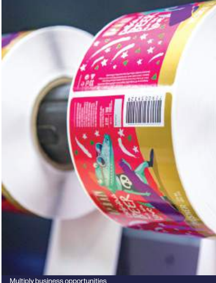
Multiply business opportunities